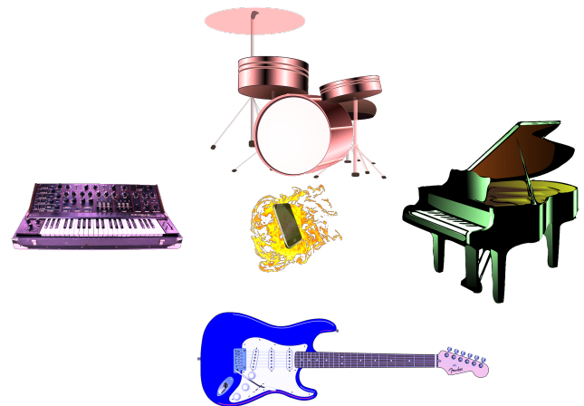
Figure 1: In Mixing Levels you can figuratively consider your mobile phone display a camera. When tilted to the right, you capture the (green) piano, when tilted to the left, you capture the (pink) keyboard, when tilted away from you, you capture the (red) drums and when tilted towards you, you capture the (blue) electric guitar. Only when perfectly leveled, you capture all instruments equally, and a massive, squeaky (yellow) synthesizer is blazing.

Mixing Levels uses quite exciting, arousing music. This could be positively shocking for young users, who are used to an overflow of visual and auditory stimuli, e.g., from video games. Users will